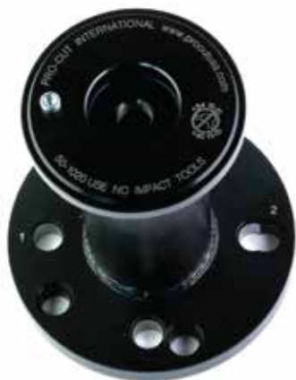
50-1020 Mini Adapter 4 on 100 5 on 112