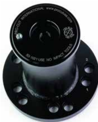
50-1021 BMW Adapter 5 on 112 5 on 120

As part of a recent partnership with BMW, Pro-Cut has released two extended length, direct-fit adapters designed specifically for BMW and Mini vehicles. These adapters can be purchased with a new lathe or bought separately.